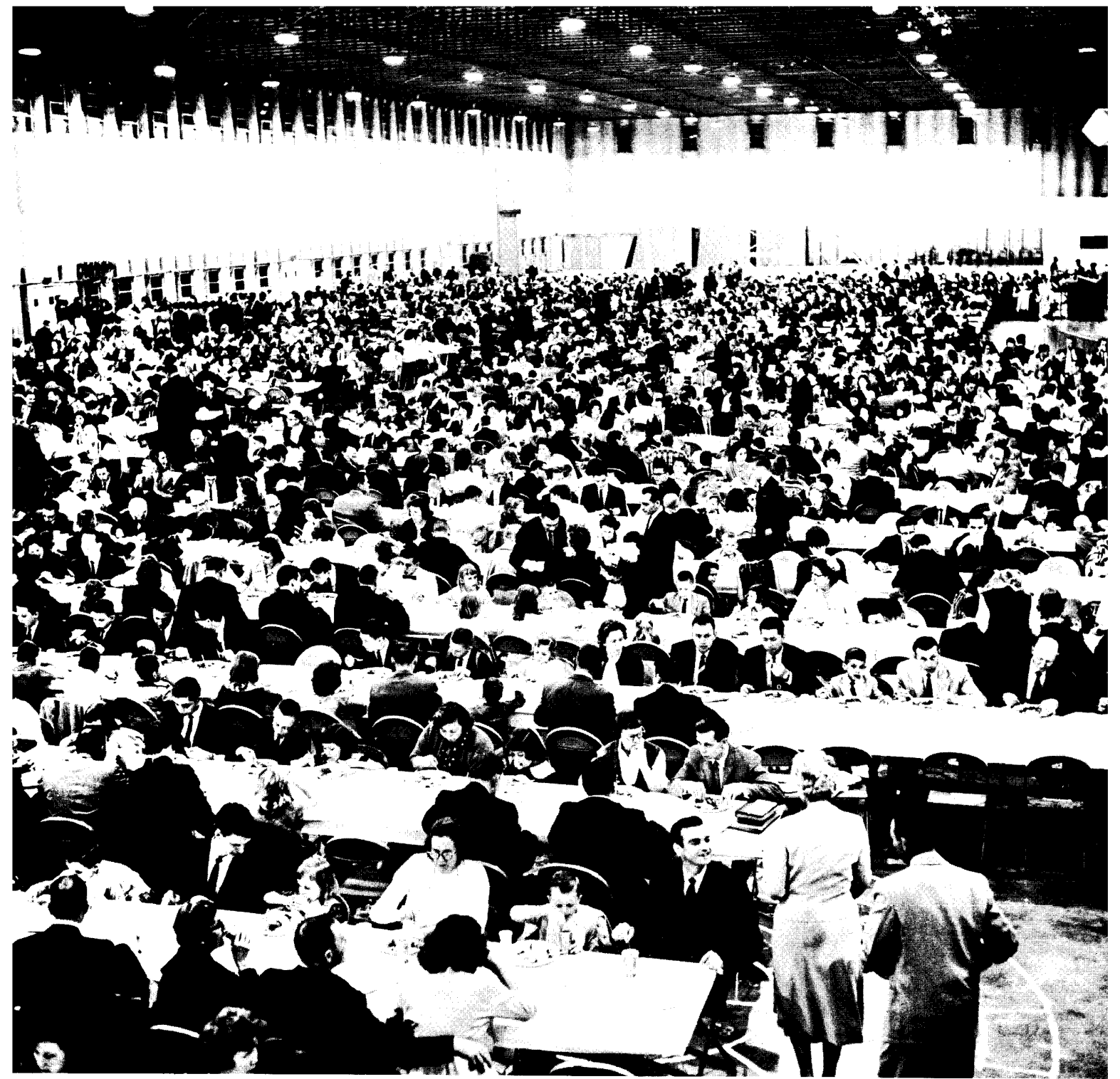
In the Big Sandy Tabernacle, everyone got a foretaste of the huge dining-room-to-be for 1965!