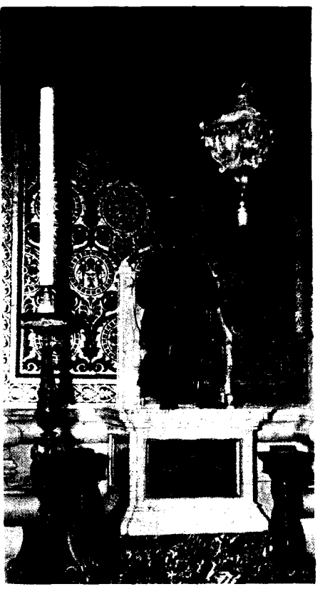
Wolfe Slides, Los Angeles

This much-revered black statue—claimed to be Peter, the Apostle—sits in the splendor of St. Peter's Basilica, its toe nearly worn away by the lips of ardent worshippers. In reality this idol represents Jupiter Olympusl